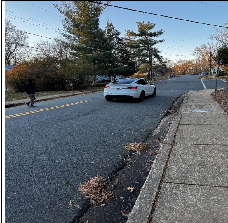
Photo 1: Critical intersections across the assessed areas lack marked crosswalks, putting students at risk